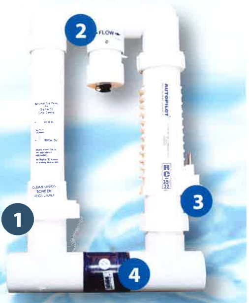
1. In-Line strainer 2. Tri-sensor 3. Chlorine production cell 4. Check valve